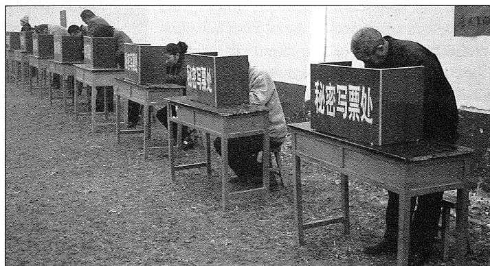
Voters at polling booths in Liujian village, Shandong Province, where there was a 96 percent turnout to elect the village head and village committee members. Some believe village elections are China’s first steps to democracy; others that they enable the Communist Party to tighten its hold in the countryside—the candidates were all approved by the Party.

The four episodes of the documentary, “Power and the People,” “Women of the Country,” “Shifting Nature,” and “Freedom and Justice,” provide faces and voices of those wrestling with the major issues, humanizing the statistics. As the introduction to each episode reminds us, Lewis and his crew had impressive access to both Communist Party officials and dissident intellectuals, along with workers and farmers for whom the rewards of economic development are often at best attenuated.